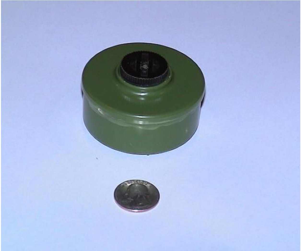
Figure 1 PMA-2 Anti-Personnel Mine Casing (size compared to quarter)